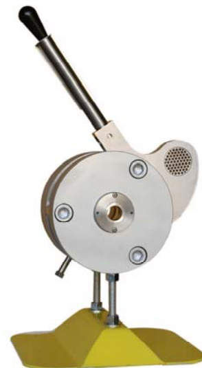
Pic.2: HSC-A 080