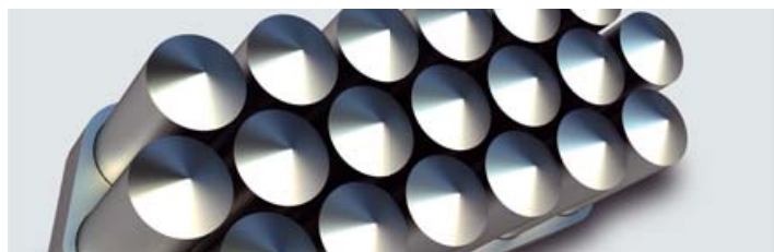
Candle filter elements (CSC-P/C)