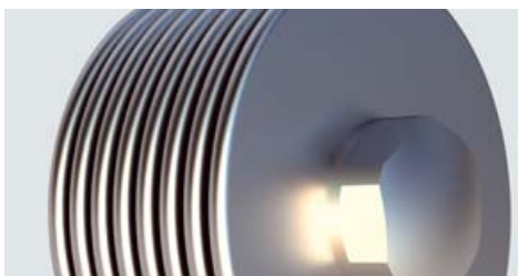
Disc filter elements (CSC-P/D)