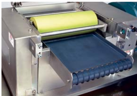
Inlet plate without return slots