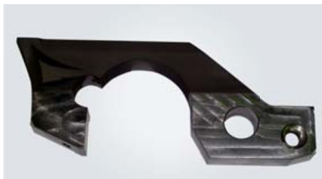
VS26-coating at the upper area

Maag Automatik currently offers various wear protection types to improve the availability of pelletizing machinery and associated components.