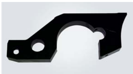
VS28 gives parts a typical black colouring