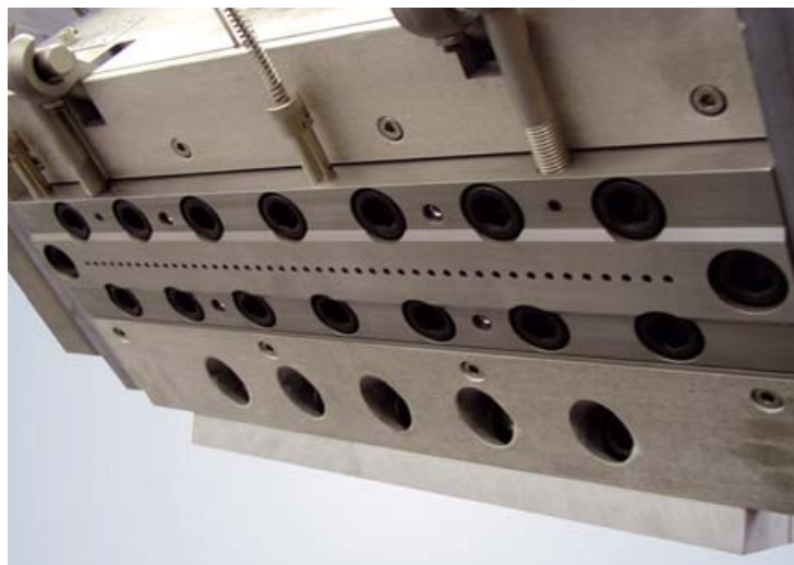
Die head SG 450 C