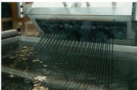
SG 300 C in production