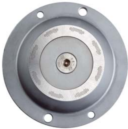
Gala Micropellet Die Plate for small pellets

Micropellet \leq 1.0 mm Minipellet < 2.0 mm > 1.0 mm.