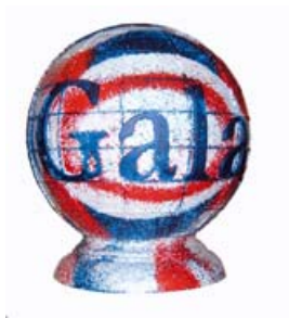
Unique pattern and coloring effect

To produce micropellets, the polymer melt must be supplied at high pressure to the die plate. It should also be filtered to prevent blocking of the die plate holes, which would require the use of a gear pump and screen changer. At the die head, a polymer diverter valve will direct melt accurately to the die.