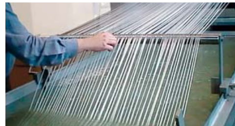
KW 600 cooling trough for up to 60 strands