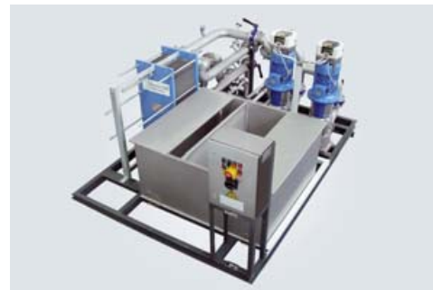
PWA 20 process water unit