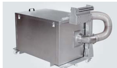
SE 400-2 air knife for dewatering