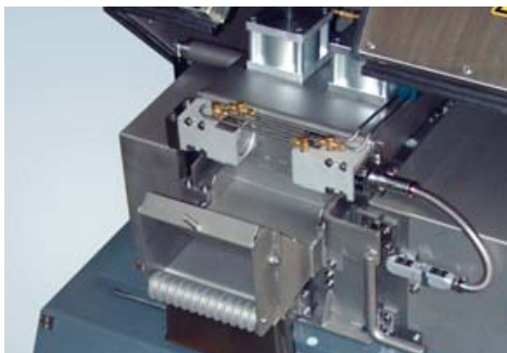
PRIMO Plus 200 U die head

The »heart« of each WSG system is the strand pelletizer. Maag Automatik offers the PRIMO Plus systems for high throughput rates, according to your specific requirements.