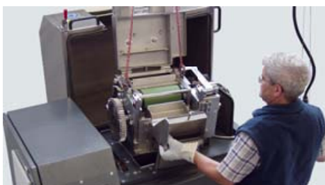
Simple exchange of the cuttinghead