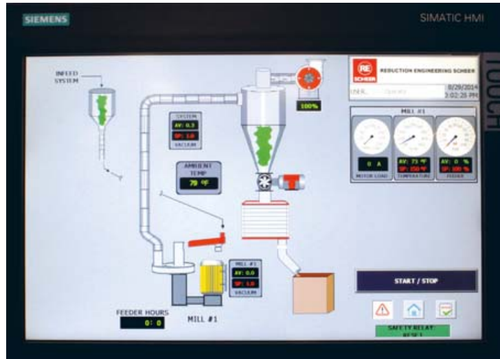
Touch Screen Controls