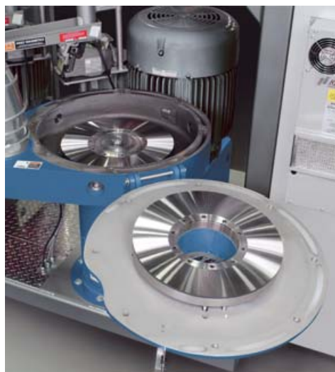
Mill Chamber with Disposable Discs

X tra performance for small and medium throughputs