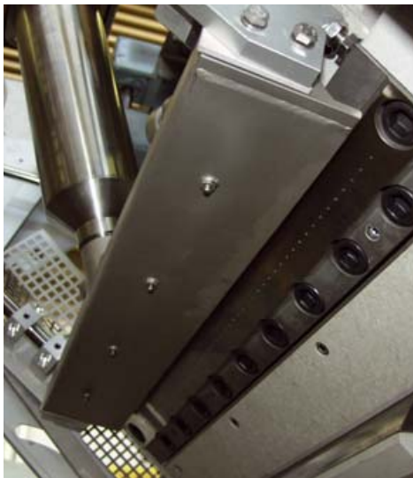
Hot Air Knife in operating position

The hot air knife works like any air knife, except that the compressed air is preheated. The air volume and pressure are mechanically regulated, while the temperature of the compressed air is controlled electrically. The device simultaneously distributes the hot compressed air across the entire operating width of the die head. It acts through the combination of the high air velocity and the temperature of the air, which is above the melt temperature, blowing or melting away unwanted residues and deposits efficiently and precisely.