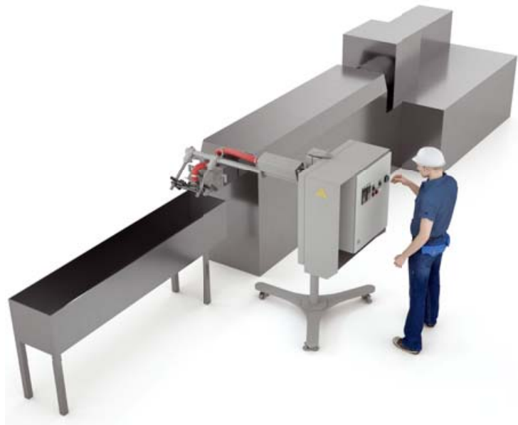
Hot Air Knife unit