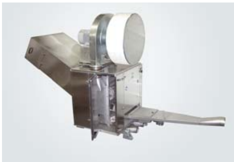
AERO impact dryer