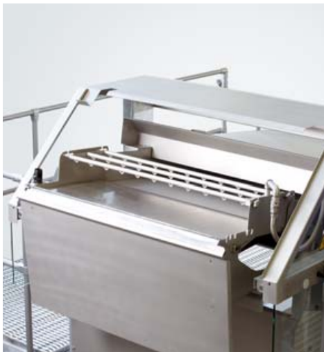
M-USG 1200 H start-up device