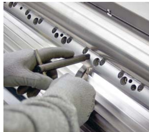
Cutting gap setting