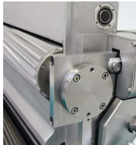
Roller bearing support outside of cutting chamber