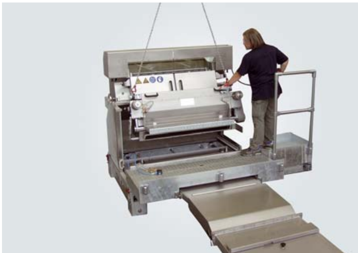
Cutting head quick-change