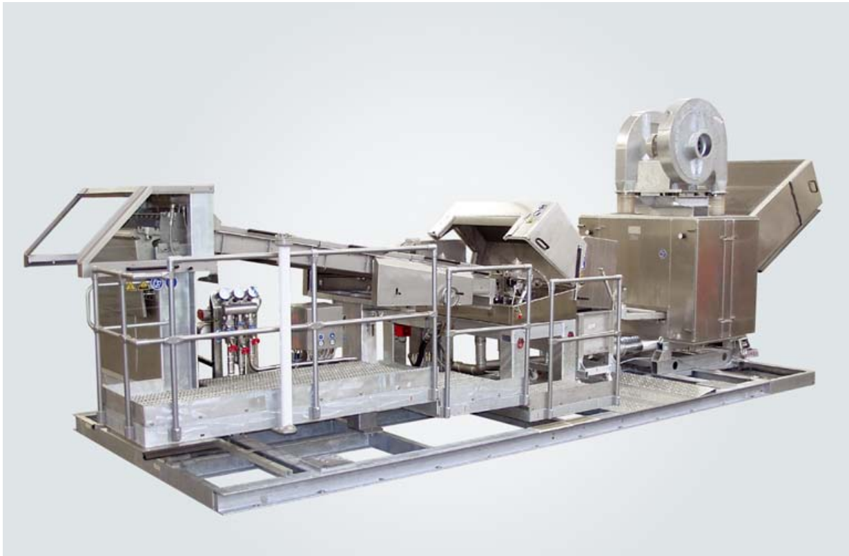
M-USG 900 H