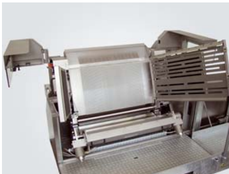
M-USG 1200 V strand guide