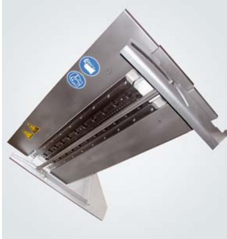
Die head with die wiper

Optimum component selection ensures high guarantees of availability, making the pelletizing process more cost-effective. Due to system layout operators have easy access for operation and maintenance.