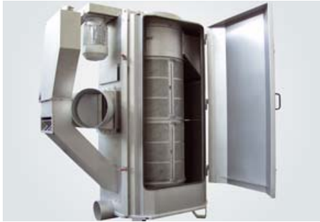
CENTRO centrifugal dryer

Underwater pelletizing strand systems – Only the quality of the system configuration counts