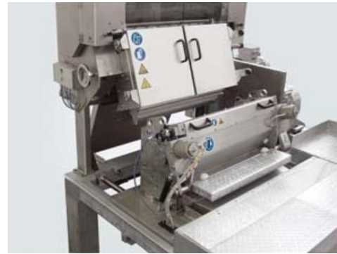
M-USG 900 V